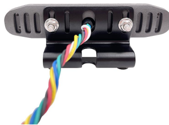
H Bracket Mount