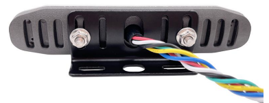
L Bracket Mount